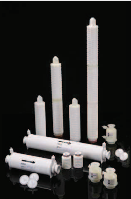
Note: PROCLEAR and DEMICAP are registered trademarks of Parker domnick hunter