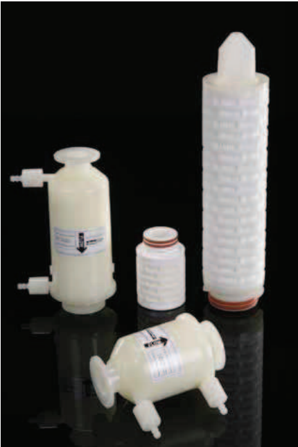
Note: PREPOR is a registered trademark of Parker domnick hunter